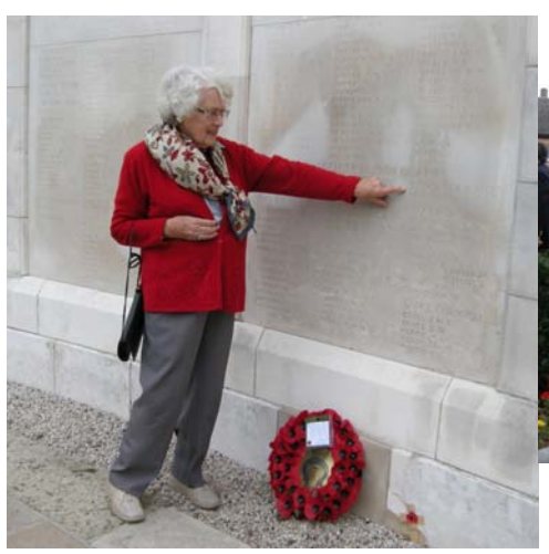
following photos say it all!